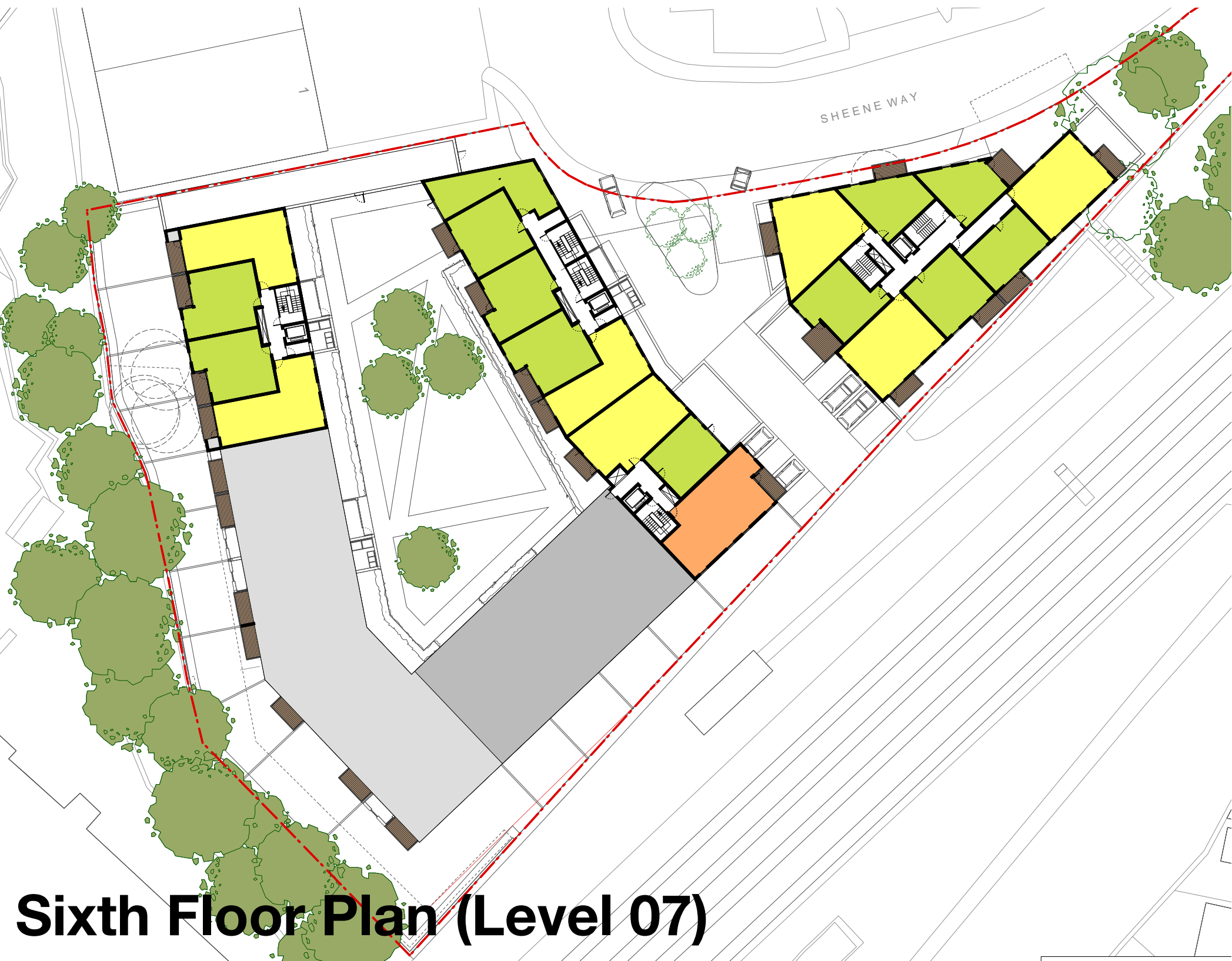
Sixth Floor Plan (Level 07)