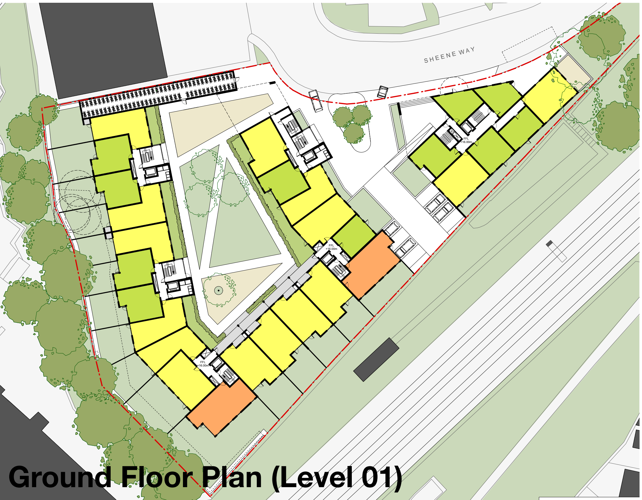
Ground Floor Plan (Level 01)