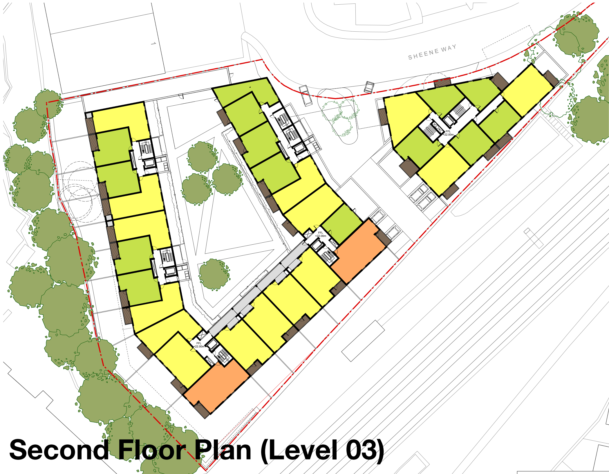
Second Floor Plan (Level 03)