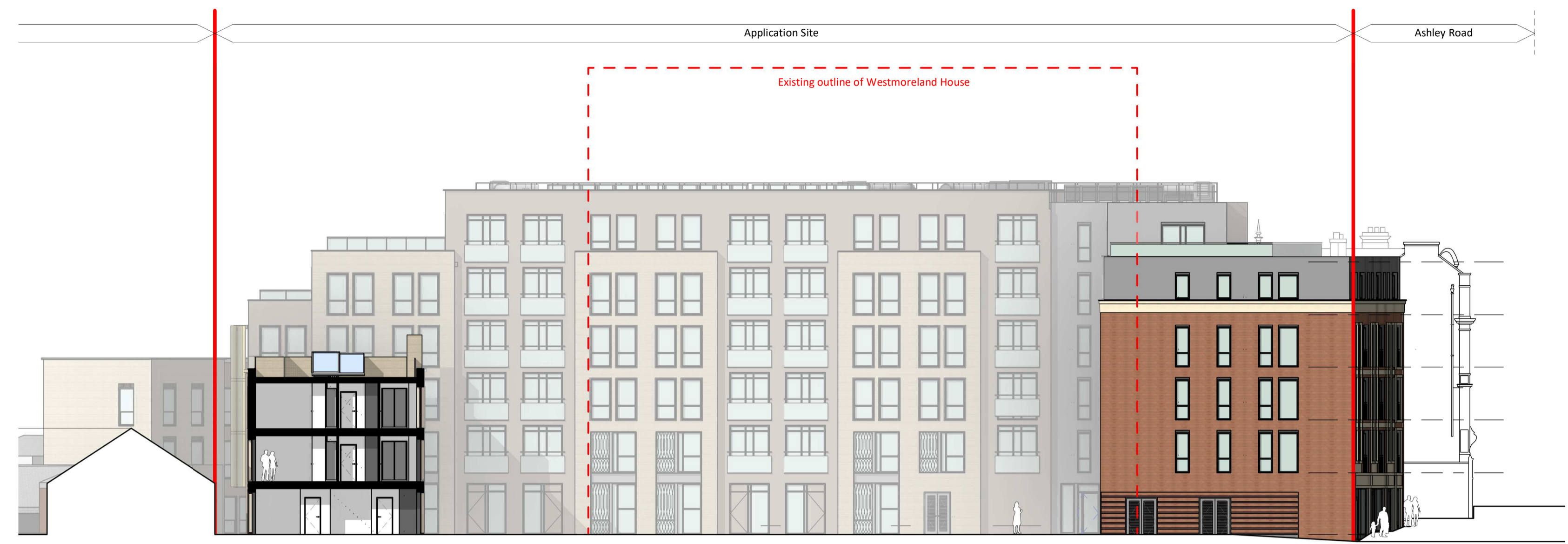
Sectional Elevation CC - Looking South West from the Residential Courtyard 1 : 200